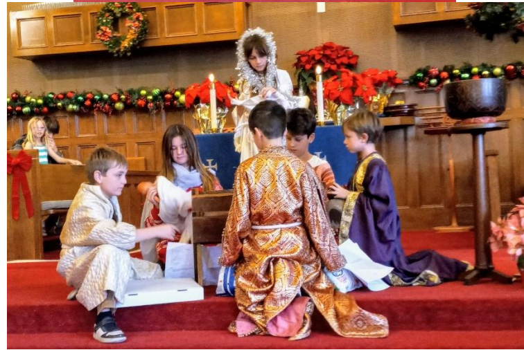
"Hey! Unto you a child is born"