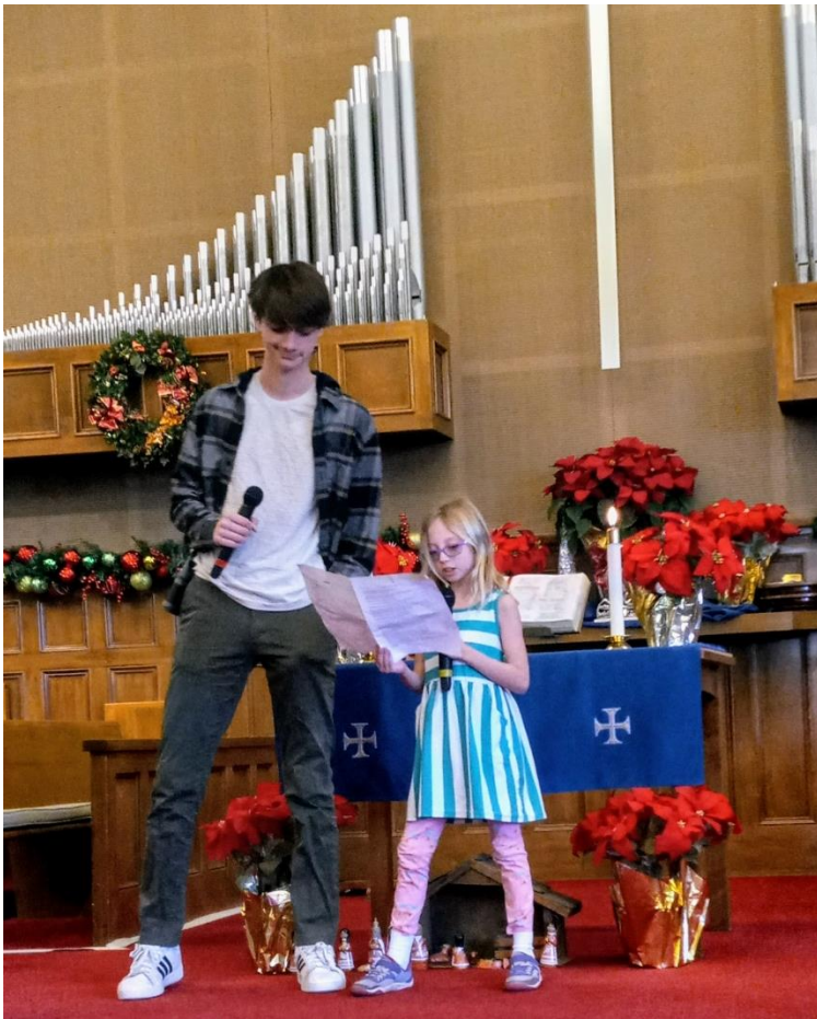
It WAS the best Christmas Pageant Ever!