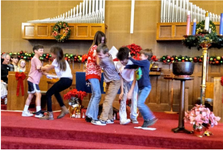
"The Herdman's were absolutely the worst kids in the history of the world"