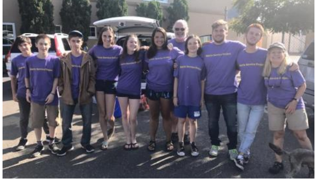
MHUCC —Sierra Service Project 2017