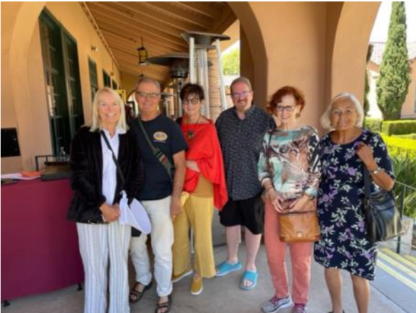
Watercolor Society & lunch outing