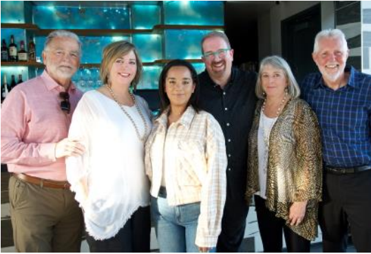
Pictured on the left: (from left to right)