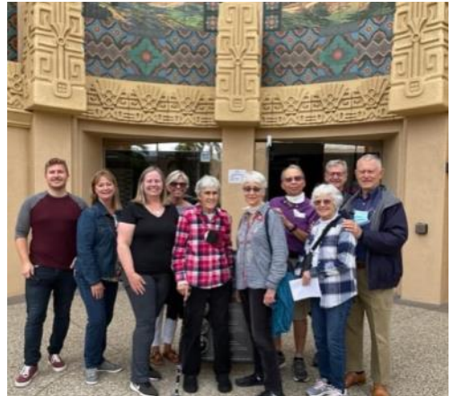
In front of San Diego Automobile Museum in Balboa Park