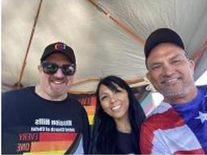
We had a booth at Pioneer Park on July 4th, with crafts, games and conversations!