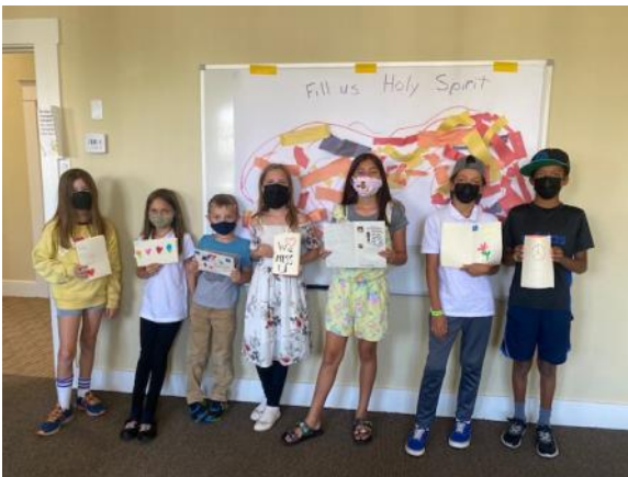
Kids made some cards to be sent to our homebound members.