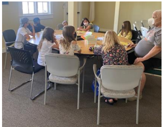
Our kids learned about the Parable of the Sower