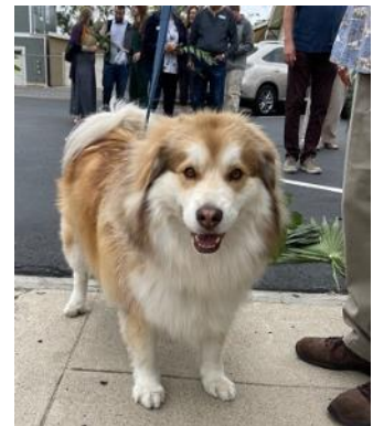
Champ was our “donkey”